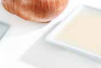
Liquid onion Art. No. 107011 For all sausages and meat products. Available in a 1-kg squeeze bottle.