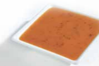
Asia Sauce AGF* Art. No. 251024 Excellent for gourmet Asian cuisine with chicken or pork.

All sauces come ready to use in a practical 3-kg pail. No artificial flavour enhancers. Simple portioning: 500 g sauce for 1 kg meat.