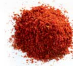
Marinade base Spicy Chili pepper/Curry Art. No. 261111