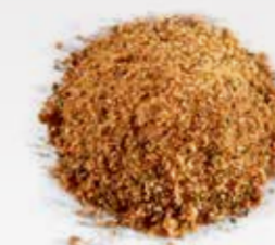
Marinade base Roastos Onion/Pepper Art. No. 261098