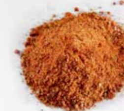
Marinade base Barbecue Tomato/Smoke Art. No. 261105