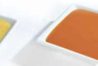
Stroganoff Sauce GF** Art. No. 251026 Great with beef and for the classic one-pan Stroganoff.