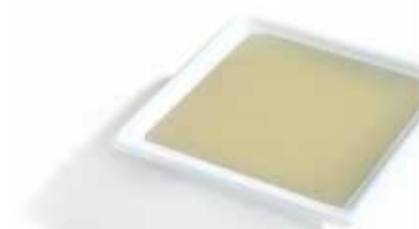
Liquid pepper Art. No. 107015 In a 1-kg squeeze bottle.