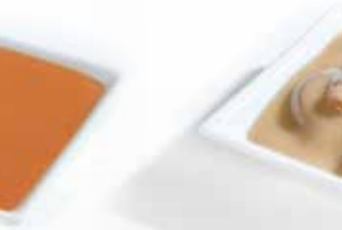
Cream Sauce à la Zurich GF** Art. No. 251027 For veal, pork or beef, perfect for emince de veau.