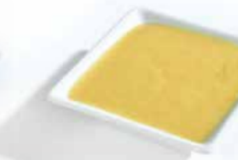
Curry Madras Sauce AGF* Art. No. 251025 Outstanding for chicken or curried meat dishes.