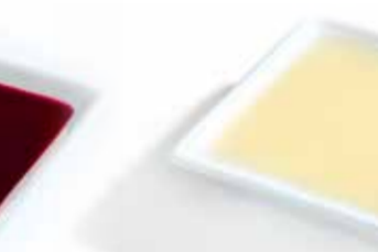
Liquid juniper Art. No. 107014 In a 1-kg squeeze bottle.