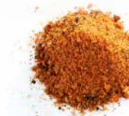
Marinade base Caribbean Curry/Banana Art. No. 161065

All marinade bases are free of allergens subject to labelling (by EU-Regulation 1169/2011) and are also excellent for sprinkling over food.