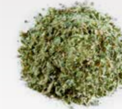
Marinade base Elmocho Herbs/Garlic Art. No. 261095

1 kg of marinade base yields 4 kg of marinade. You only need water and oil – and you're done! Mix the marinade base with water. Add the oil. Marinade the meat and you're done. It tastes perfect and is easy to use. The advantages are lower costs, easy to store, no special refrigeration and simpler logistics.