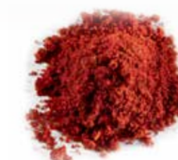
Marinade base Chickos Curry/Paprika Art. No. 261097