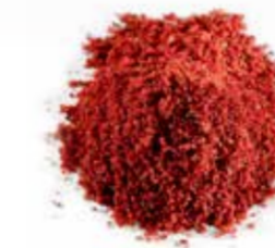
Marinade base Pikantos Paprika/Chili pepper Art. No. 261096