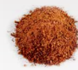
Marinade base Rustica Pepper/Paprika Art. No. 261094