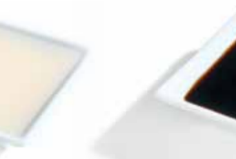
Liquid seasoning Art. No. 197006 The ideal complementary seasoning for sausage and meat. In practical 6-kg canister.