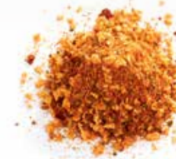
Marinade base Exotic-Mix Banana/Pineapple Art. No. 161066